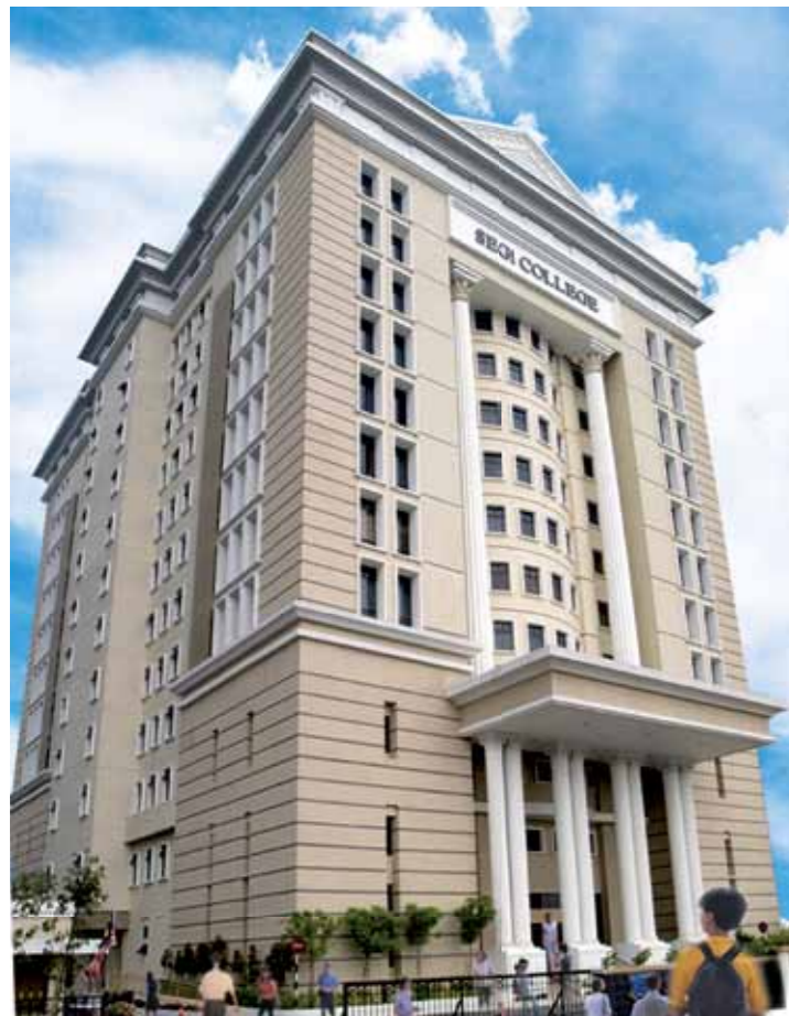
SEGi College Subang Jaya Campus

SEGi Group of Colleges is one of Malaysia's largest private higher education provider with campuses in Kota Damansara, Subang Jaya, Kuala Lumpur, Penang and Sarawak. Students who study at SEGi College will have the benefit of learning through a variety of methods, including lectures, seminars, workshops and presentations from both national and international sources.